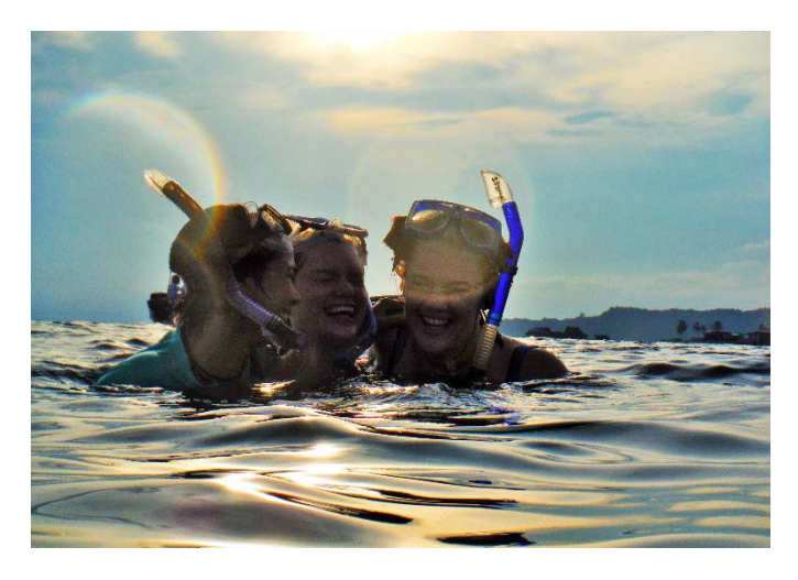
SIT Study Abroad programs may venture off the usual tourist track. Pay careful attention to health and safety guidelines.

You may find that local customs and practice, as well as varying US physicians' approaches, at times conflict with these guidelines. It is essential that you review these health guidelines and requirements with your physician, to discuss individual issues such as pre-existing medical problems and allergies to specific drugs. Any further questions or concerns should be directed to the US Centers for Disease Control and Prevention (CDC) (www.cdc.gov/travel) or to your own physician.