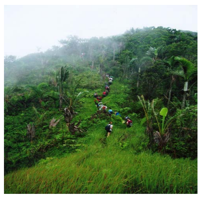
SIT Study Abroad programs may venture off the usual tourist track. Pay careful attention to health and safety guidelines.